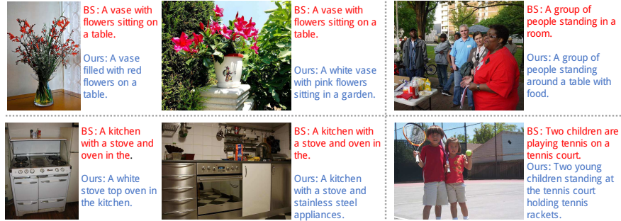
Fig. 4. Qualitative results by baseline model and our proposed model.