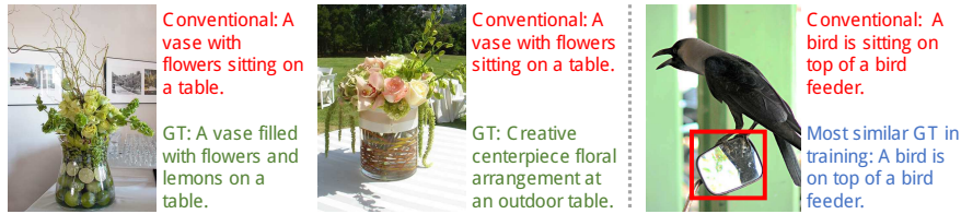
Fig. 1. Examples of generated captions by conventional captioning models. The generated captions are templated and generic.

the captioning models only learn a stereotype of sentences and phrases in the training set, and have limited ability of generating discriminative captions. The image on the right part of Fig. 1 shows that although the bird is standing on a mirror, the captioning model generates the caption “A bird is sitting on top of a bird feeder”, as a result of replicating patterns appeared in the training set.